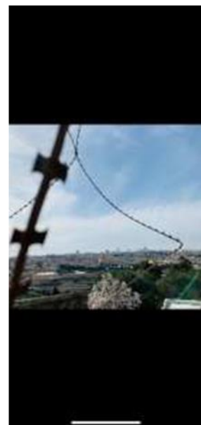
School photos: Clockwise from left - Kibbutz Gezer mid/high school; Eynot Yarden; Sur Baher; A Tur; Kibbutz Gezer Elementary; Mekif Tuba.