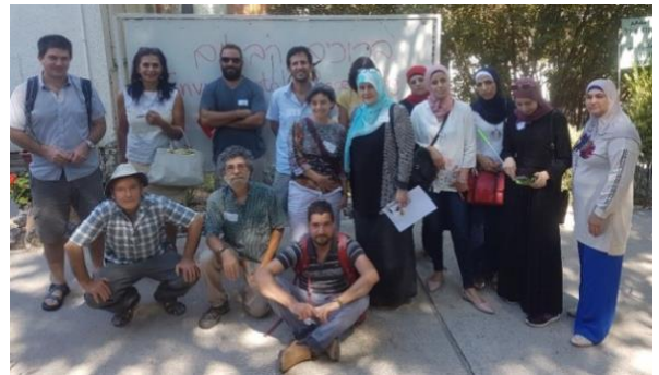
2019 Workshop Participants