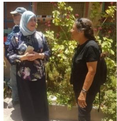
Members of Kibbutz Gezer visit Sur Baher, East Jerusalem