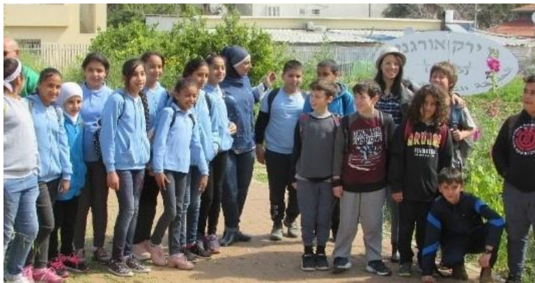
Students from Lod & Rehovot had a great time at their first joint activity